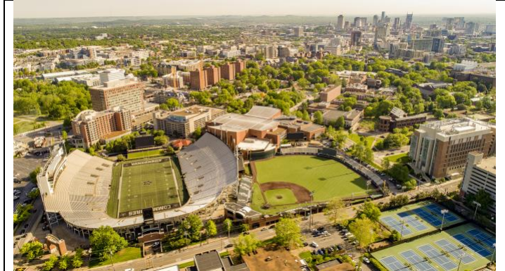
A panoramic view of Vanderbilt Campus with Nashville downtown

https://en.wikipedia.org/wiki/Nashville,_Tennessee